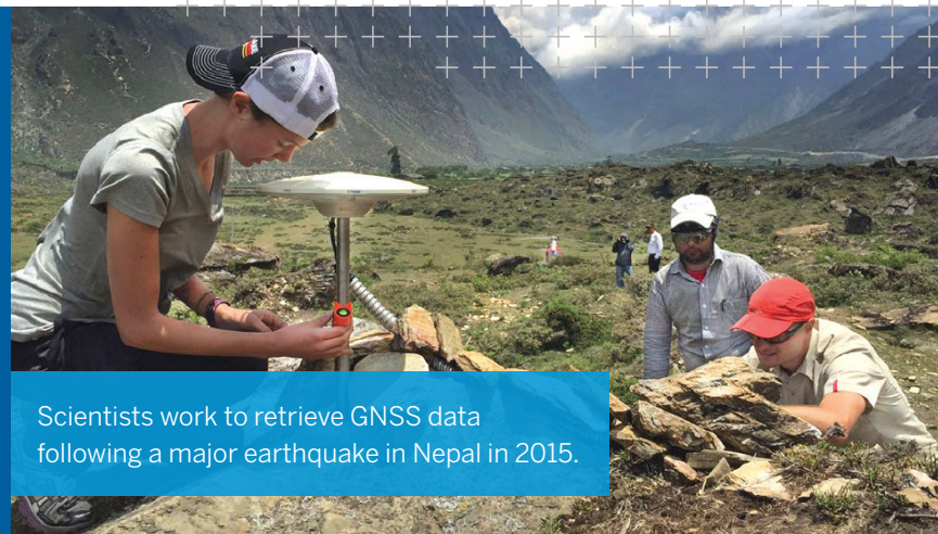
Scientists work to retrieve GNSS data following a major earthquake in Nepal in 2015.

National, regional and local governments, and non-governmental organizations (NGOs) utilize Trimble technologies in areas including land, asset and forestry management; provision of active geodetic infrastructure; monitoring of dams, volcanoes, and earthquake faults; and disaster recovery. When major natural disasters such as earthquakes, tsunamis, wildfires, and floods occur, Trimble has a long history of donating money, time, and equipment to assist communities in the recovery effort. Trimble has contributed to providing technologies and data used to combat public health emergencies, improve quality of life, and create more responsive systems.